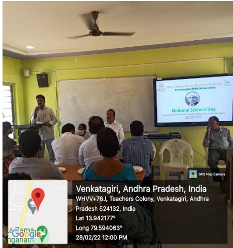
Venkatagiri, Andhra Pradesh, India WHVV+76J, Teachers Colony, Venkatagiri, Andhra Pradesh 524132, India Lat 13.942177° Long 79.594063° 28/02/22 12:00 PM