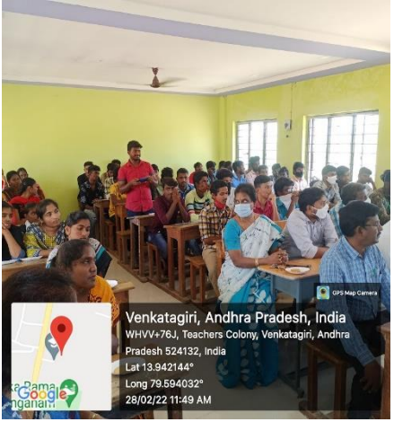
Venkatagiri, Andhra Pradesh, India WHVV+76J, Teachers Colony, Venkatagiri, Andhra Pradesh 524132, India Lat 13.942144° Long 79.594032° 28/02/22 11:49 AM