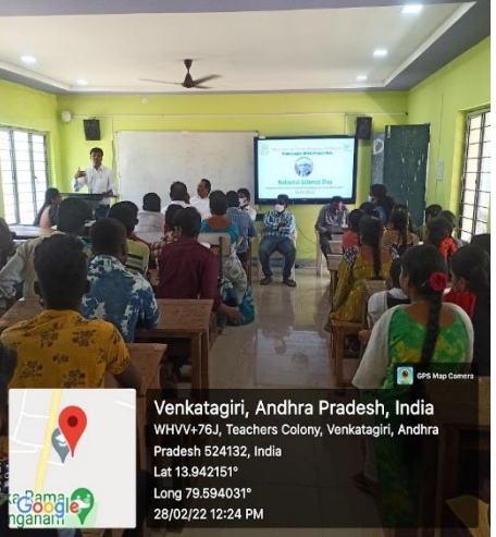
Venkatagiri, Andhra Pradesh, India WHVV+76J, Teachers Colony, Venkatagiri, Andhra Pradesh 524132, India Lat 13.942151° Long 79.594031° 28/02/22 12:24 PM