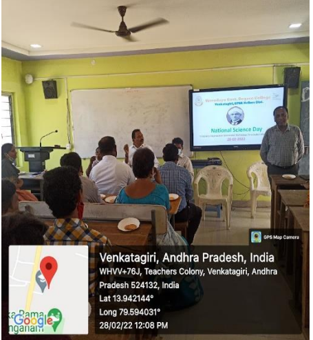
Venkatagiri, Andhra Pradesh, India WHVV+76J, Teachers Colony, Venkatagiri, Andhra Pradesh 524132, India Lat 13.942144° Long 79.594031° 28/02/22 12:08 PM