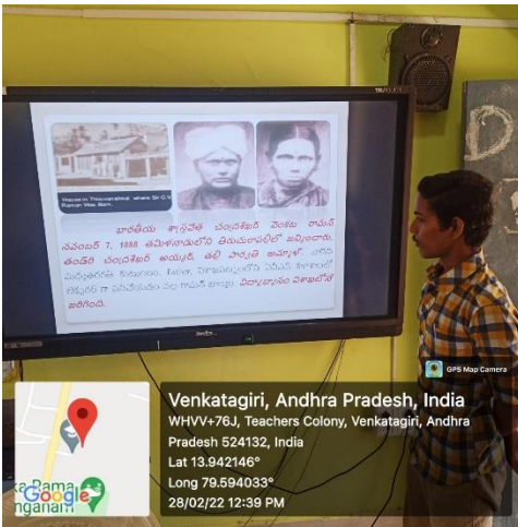
Venkatagiri, Andhra Pradesh, India WHVV+76J, Teachers Colony, Venkatagiri, Andhra Pradesh 524132, India Lat 13.942146° Long 79.594033° 28/02/22 12:39 PM